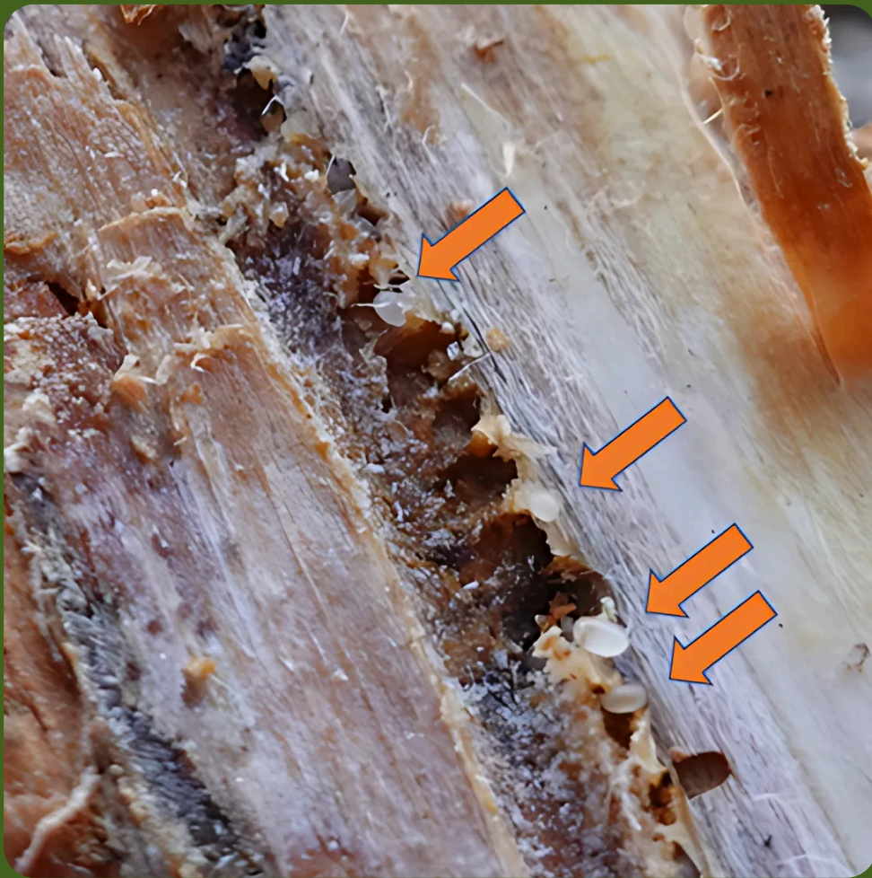
Close up of eggs (orange arrows).