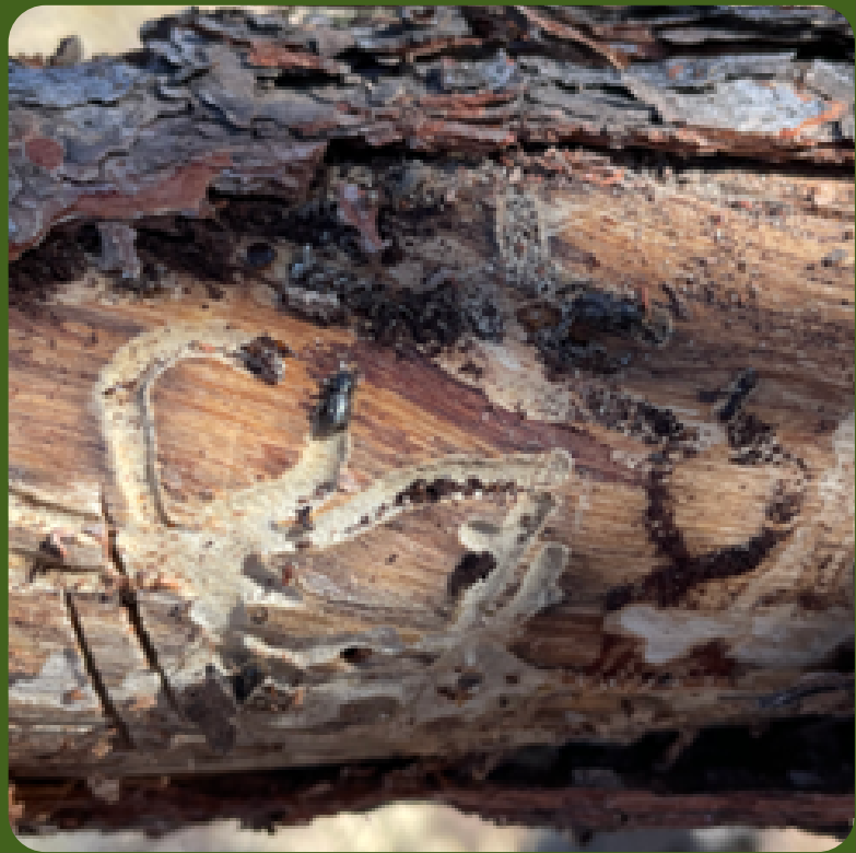
Y shaped egg gallery of piñon ips (left). Feeding gallery of piñon ips (right).