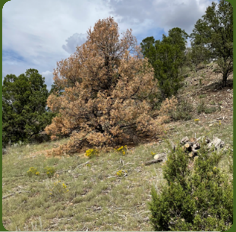
Fading trees (above) attacked by Piñon Ips bark beetles.